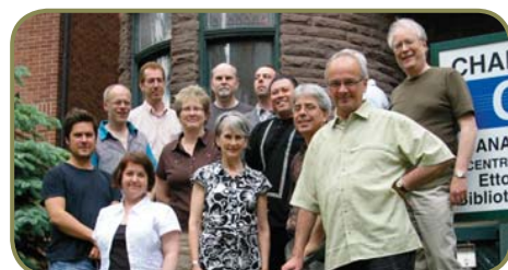
CLC Annual General Meeting – June 2008

throughout and across Canada in this and upcoming years.